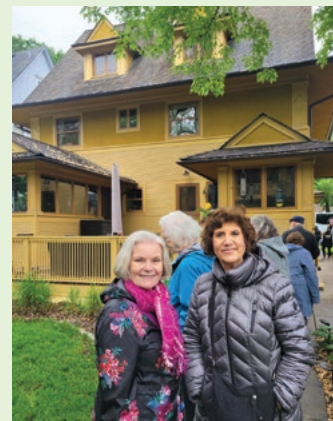
right: A day in Oak Park, Frank Lloyd Wright and Neighborhood Tour.