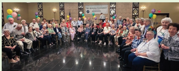
90+ Birthday Celebration, celebrating Maine Township residents who are 90+ years of age or older.