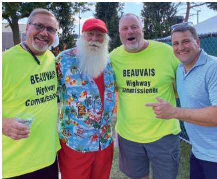
Catching up with Summer Santa Claus at Taste of Park Ridge.