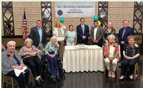
90+ Celebrants ages 100 to 104 with Township Officials