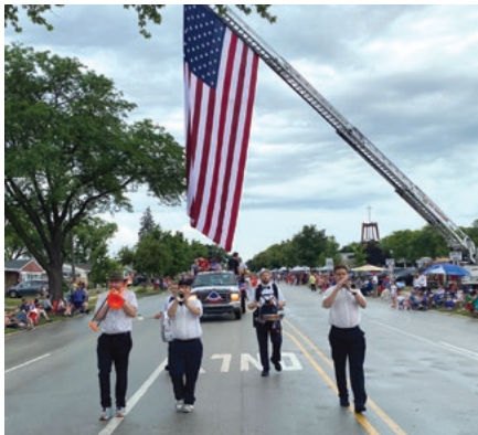
Niles Fourth of July Parade.

This is the time of construction season when we prioritize the maintenance of sidewalks, curbs & gutters, as well as streets and right-of-way under our jurisdiction in the unincorporated area of Maine Township. This year we are focusing on a proposed Sidewalk Extension and Bike Lane in the area of Church Street and Western Avenue in Des Plaines, which will include but not be limited to