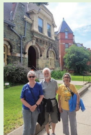
right: Enjoying the historic Pullman neighborhood Tour.